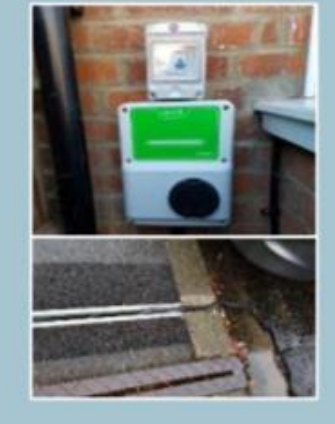
Figure 3: On-street charging technologies included in the Go Ultra Low Oxford trial.